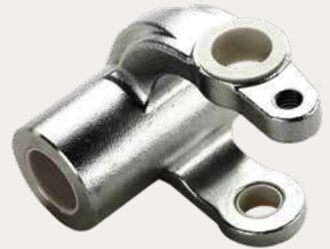
5 FINAL PRODUCT