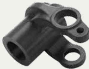
3 PRINTED MODEL