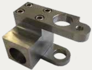
1 ASSEMBLY FROM MACHINED COMPONENTS

ELCEE offers engineered industrial components and assemblies produced at best-cost locations. We specialise in producing small to medium quantities of machined and assembled castings, forgings and welded assemblies. Our engineers will help to transform your components into cost-effective products. We start with your specific requirements and can manufacture in a wide variety of materials, including steel, (duplex) stainless steel, aluminium, iron, brass, metal and plastics. The production and assembly processes we offer include casting, injection moulding, forging, sintering, welding and machining.